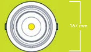
Cut out size: 163 mm